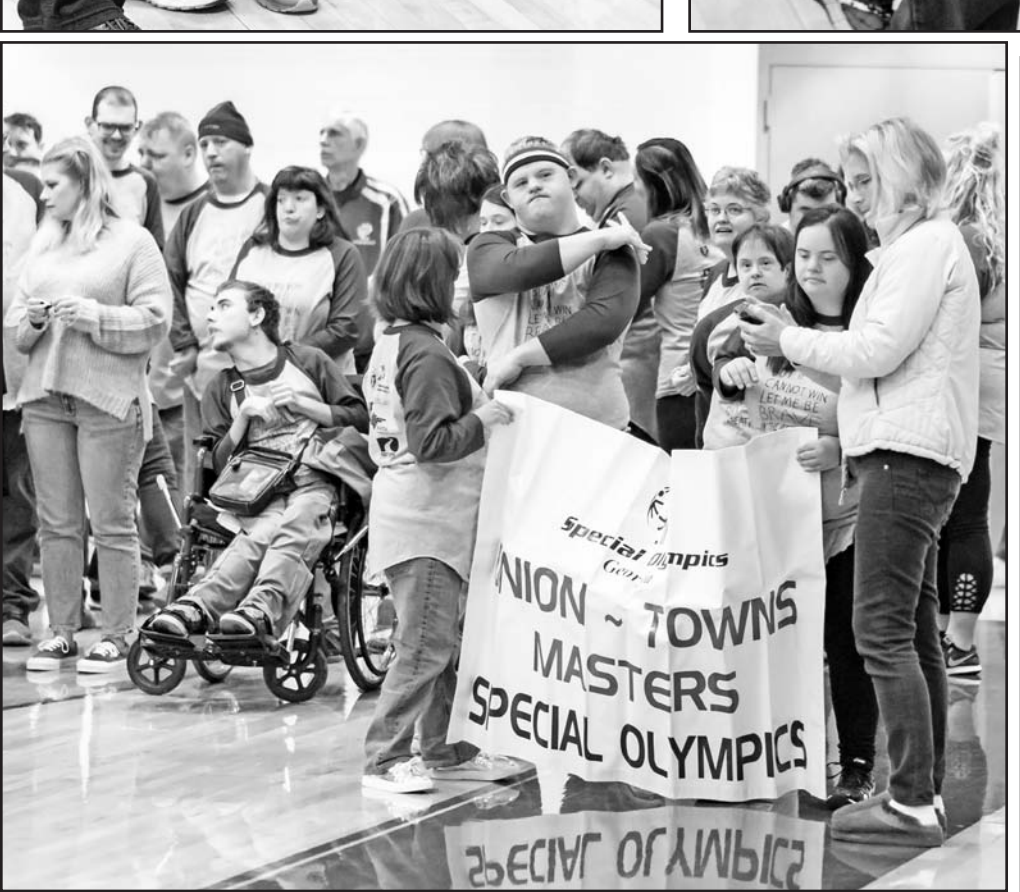
The Towns-Union Special Olympics, held earlier this month, are always a treat for competitors, volunteers and everyone in attendance. The spring event will be held later in the school year.